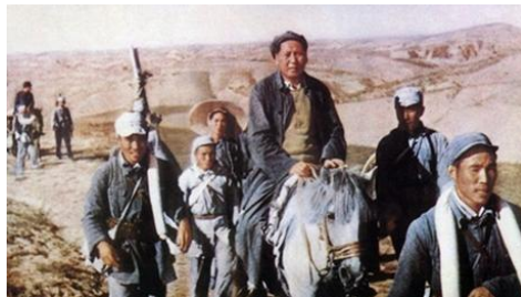
The leader of CCP Moa Zedong.

According to records, the CCP repeatedly used the human wave tactics, forced and used counter-revolutionary families to do the shields to fight on their behalf during China's civil war. That's why the Communist Party won the battle.