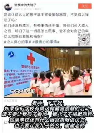
The Epochtimes, 12 January 2024

Recently netizens have discovered that "pet mobile cremation vehicles" are on the streets, they discussed on social media. The pet mobile cremation vehicle is 5.3 meters long, 2 meters wide, 2.47 meters high, and a total weight of 3.51 tons. It can incinerate up to 120 kilograms of pets at a time. It claims that the combustion process is smoke-free, no exhaust, and odorless, and it has legal and non-toxic properties. Qualified for hazardous chemical treatment, up to 30 pets can be fully cremated without any debris.